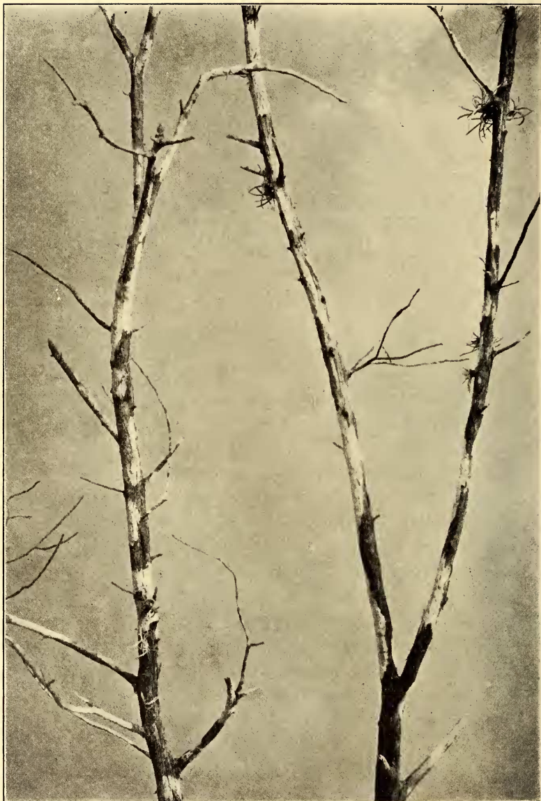
FIG. 1. View of host showing the conspicuous patches on which the fungus fruits are located.